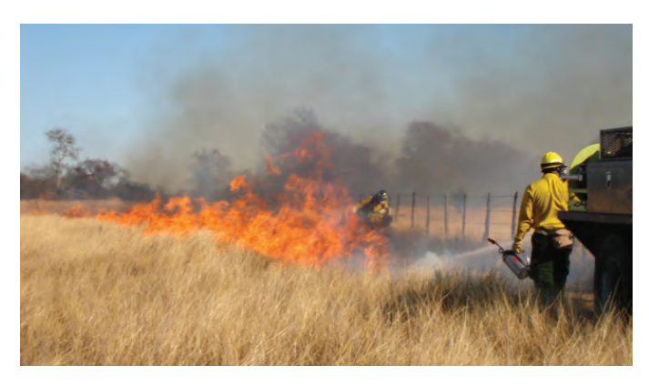
Prairie grasslands historically burned frequently—a natural ecological process.

The Balcones fire management team includes experts in both prescribed and wildland fires. They develop burn plans to retore the role of fire for habitat diversity. They also protect wildland urban interface communities from the threats of fire by reducing fuels. The team even travels to other refuges to help them with prescribed burns.