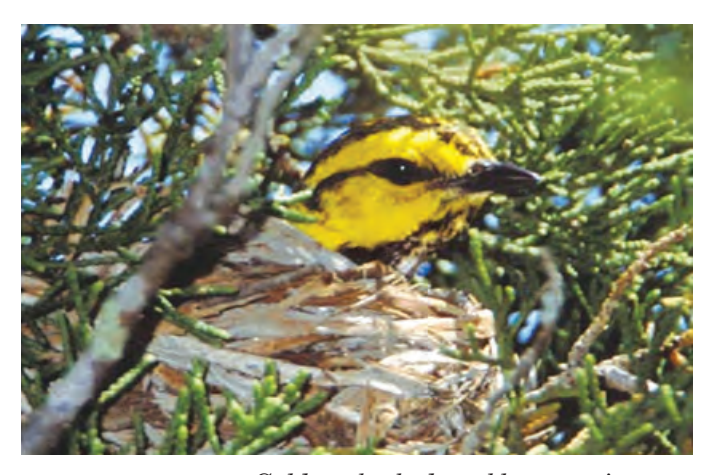
Golden-cheeked warblers nest in dense forests that can be destroyed by wildfire. Managers construct shaded fuel breaks around nesting habitats to reduce wildfire threat.

Fire managers avoid nesting season when they prescribe burns. To maintain habitat, they set light or "cool" fires to penetrate part way into the oak-mottes. The flames leave the taller bushes and trees intact, remove understory and prevents to many Ashe junipers from growing in the area. To return the oak shrublands to an earlier succession stage, managers apply fire and mechanically remove taller trees that survive the burn. When the vireos arrive in spring from a winter in Mexico, they find their nesting places more inviting than ever. The refuge then helps the birds further by trapping brown-headed cowbirds that prev on vireos by laving their eggs in vireo nests.