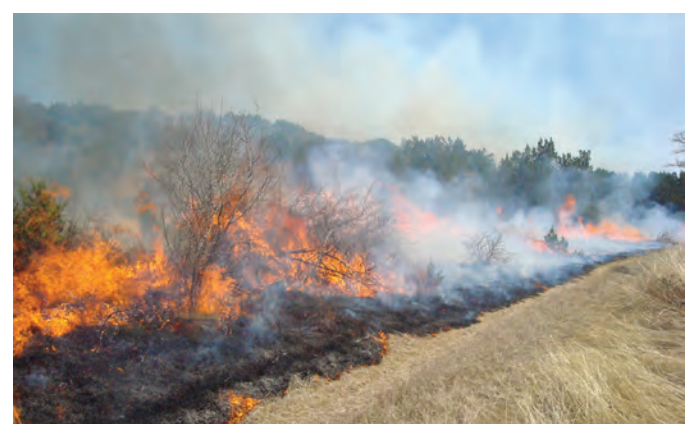
Prescribed burns typically use natural and human-made fuel breaks to contain the fire.