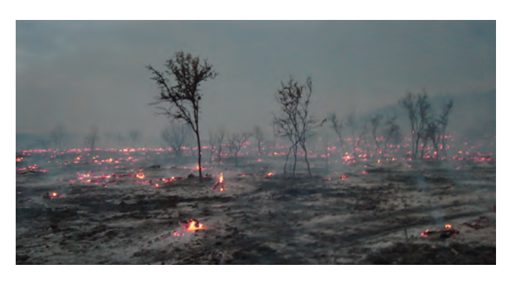
Higher nighttime humidity helps extinguish many fires.

To visit a native prairie in this part of Texas is to step into a life-filled land where big bluestem and Indian grass ripple in the winds, where foxglove and Indian paintbrush bloom and songbirds take shelter. Most of the native grasslands and savannahs have vanished after years of plowing and intense grazing. However, the refuge grasslands hold the promise of a native prairie's return. Prescribed fires are promoting native plant restoration, and the control of invasive plants like second-growth juniper, prickly pear and false willow, as well as of exotic plants like the King Ranch bluestem.